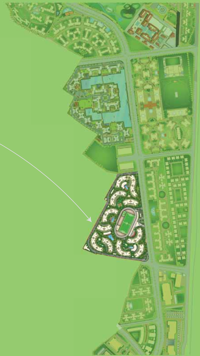
Layout of The Meadows