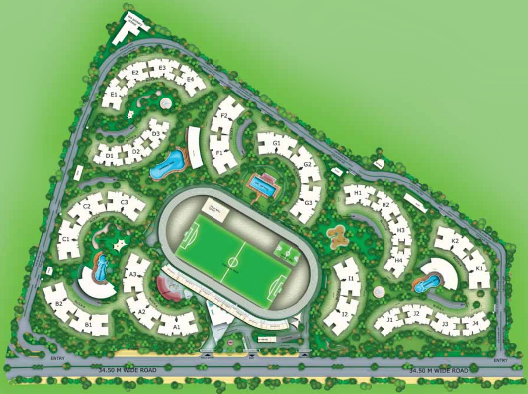
Layout of The Meadows