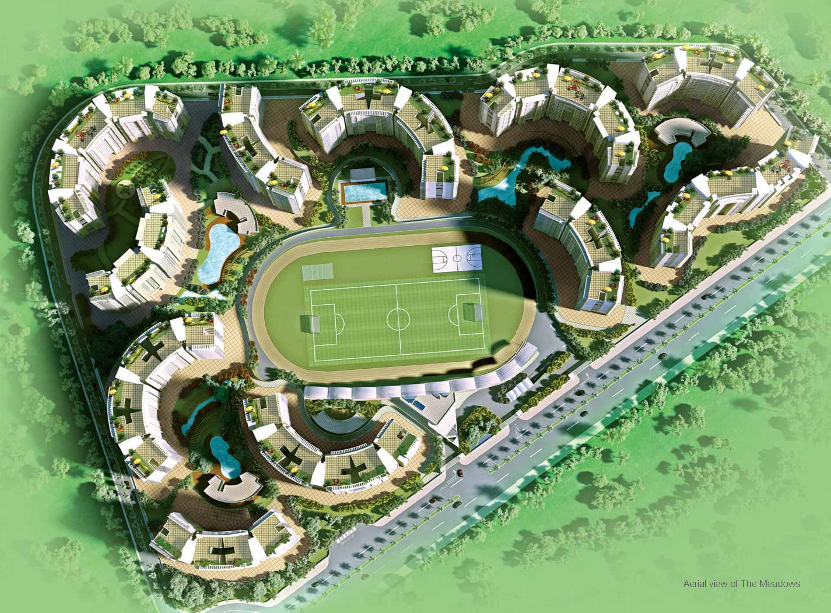
Aerial view of The Meadows